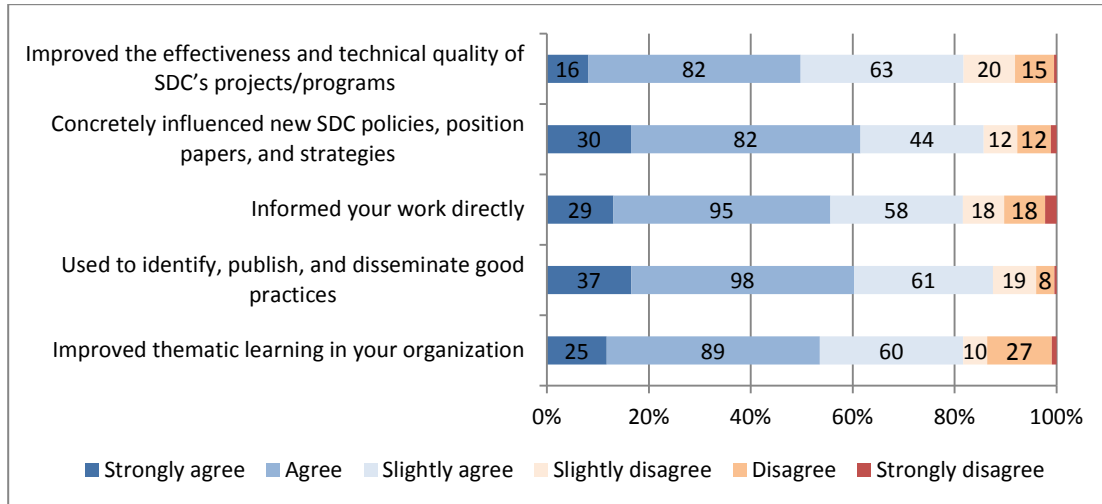
Figure 2: Perceived influence or impact of SDC thematic networks by SDC HQ and SCO staff